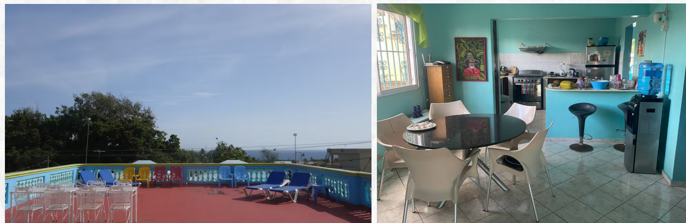
All units include utilities, Wi-Fi, and basic amenities.