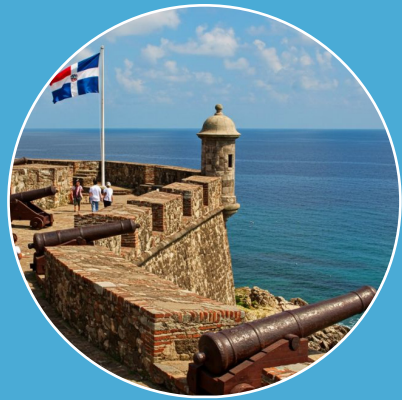
Fortaleza San Felipe

Puerto Plata is one of the oldest cities in the Dominican Republic, founded in the late 1400s during the early Spanish colonial period and later developing into an important port for trade in the 19th century. This history is still visible today in the historic center, where colorful Victorian-style architecture and a lively central square reflect both its rich past and vibrant present.