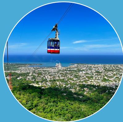
Teleférico de Puerto Plata